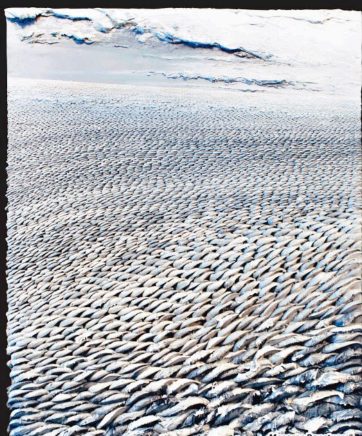
Life is Black and White Now (4 ft x 3 ft)

learning to be disciplined enough to learn by rote. Pancture Paintings have closed a gap in the industry. Where repetitious works of art were without definition, Pancture Paintings defy that premise. They involve the viewers thinking; simply with a realism point of view. The ocean can comfort – it can be threatening or even become an unyielding, unforgiving sea that will take your life. One may even look out upon it all day while sitting on the shore, perhaps contemplating the eternal. God has blessed us with a world that breathes our very life's breath.