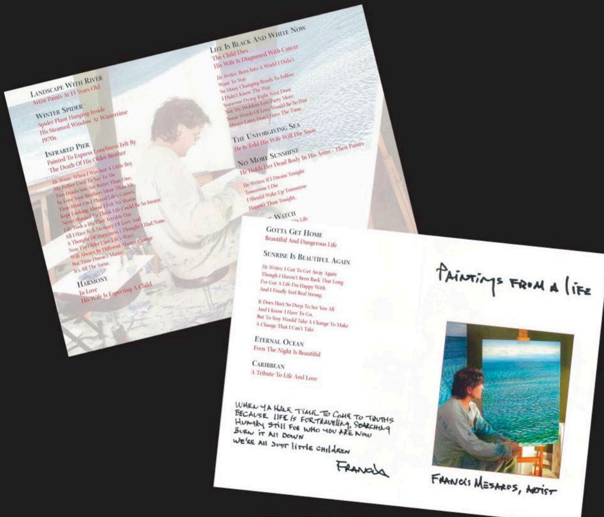
Artist's Exhibit Pamphlet