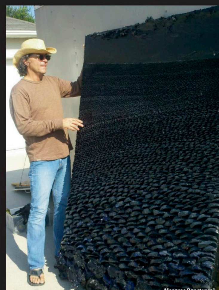
Majestic Eternal Ocean (6 ft x 5 ft)

twilight — better yet, midnight — towards the water that beckons you to bare your trembling soul as Mesaros does his. Mesaros chooses to sculpt with oil paints. His sole tools are palette knives; in his hands they are the perfect instruments to portray the energy of the sea and they are the only instruments that allow him to spontaneously depict his feelings as they run through him. His ability to capture the intricacy and depth of color in his work come from a controlled frenzy of the senses, in absolute intuitive manner. "This is my life's worth, without this I am nothing."