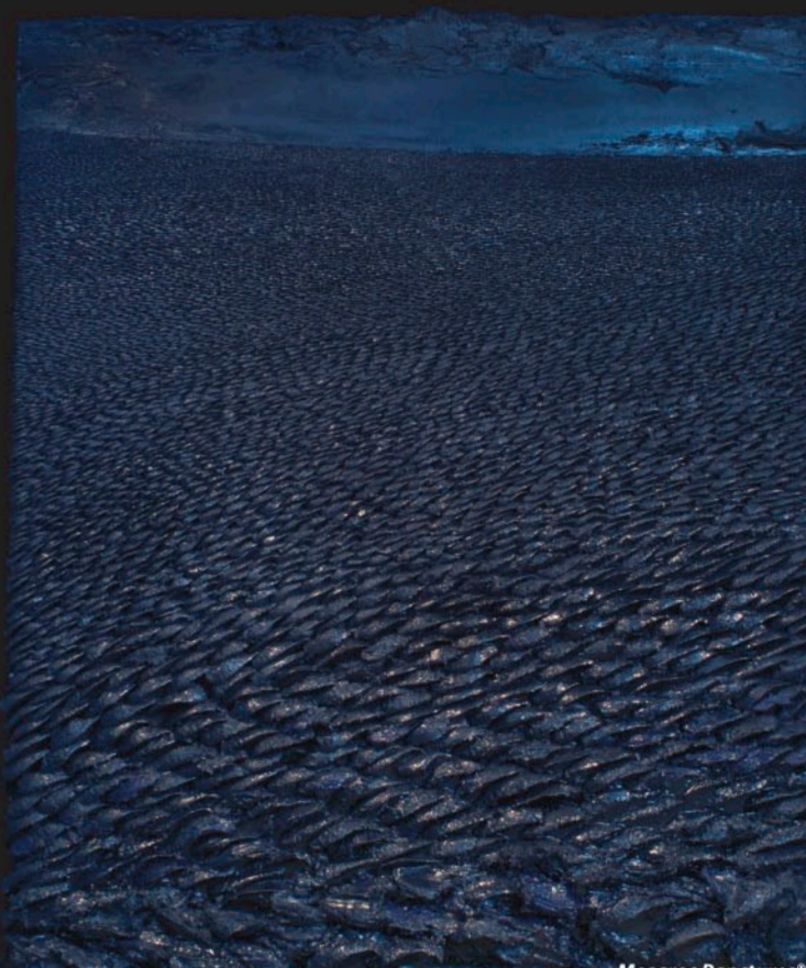
Majestic Eternal Ocean (6 ft x 5 ft)

Mesaros' Panctures are as mesmerizing as the sea itself. Starting at the horizon line, which occurs about a fifth of the way from the top of the Pancture, the waves begin as tiny slivers of paint that advance down the canvas, row upon row, in ever larger, scale-shaped strokes. By the time they reach the bottom, the semi-circles of paint are thick and dimensional. They cantle over from the painting's surface like a wave crashing to the shore. Each glistening, dimensional stroke catches the ambient light that falls upon it, sending forth a sparkling highlight that is as real—and as evanescent—as the glint from an ocean wave.